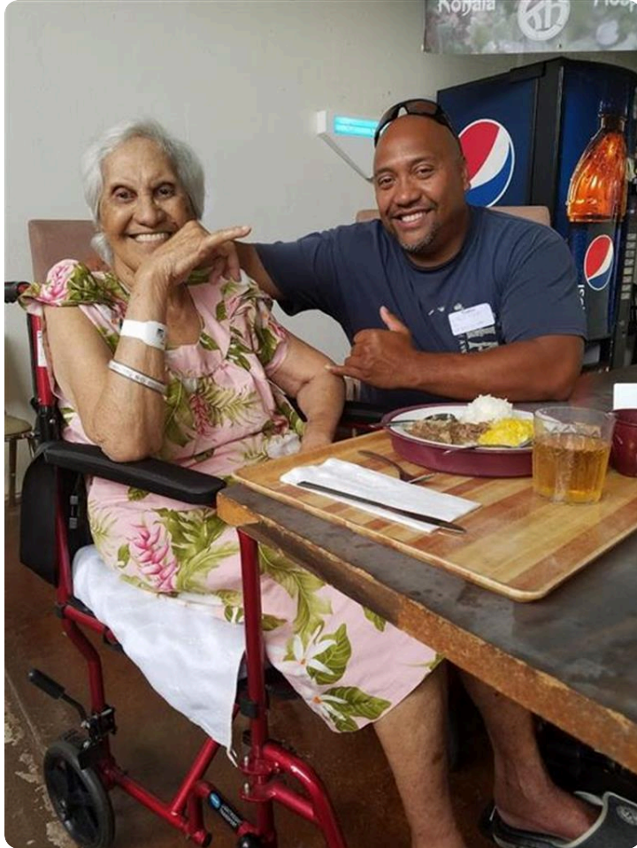
Having Lunch with Grandma!